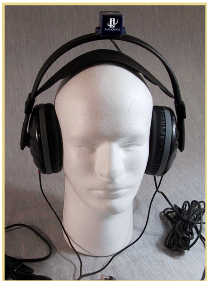
AuSIM headphones, with standard head-orientation tracker mounted on the headband

GoldServe™ is a complete 3D sound-localization server subsystem; a peripheral to one or more "host"